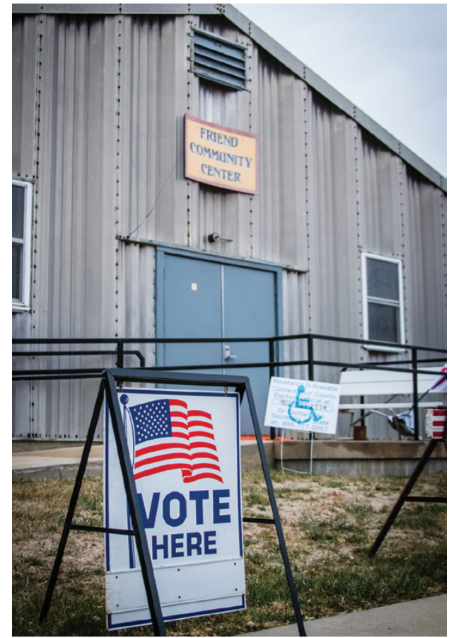
Despite the rain and wind on Nov. 8, when the polls opened over 20 Friend registered voters were gathered at the Community Center ready to cast their vote. Election results will be available in the next week.